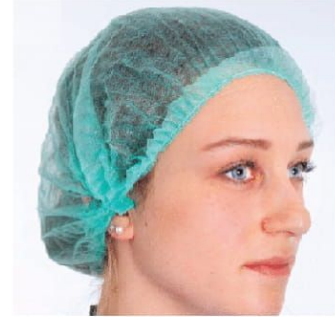
Customizable product. Photo for reference only.

Our hood is made of breathable material, it does not sweat. It offers a perfect fit and resistance and has ties at the back for more comfortable use. It can be used in a highly hygienic professional context such as clinics, hospitals, dental offices, medical offices, analysis and research laboratories. Provides hygiene and protection from minimum risks. Absorbent band can be used.